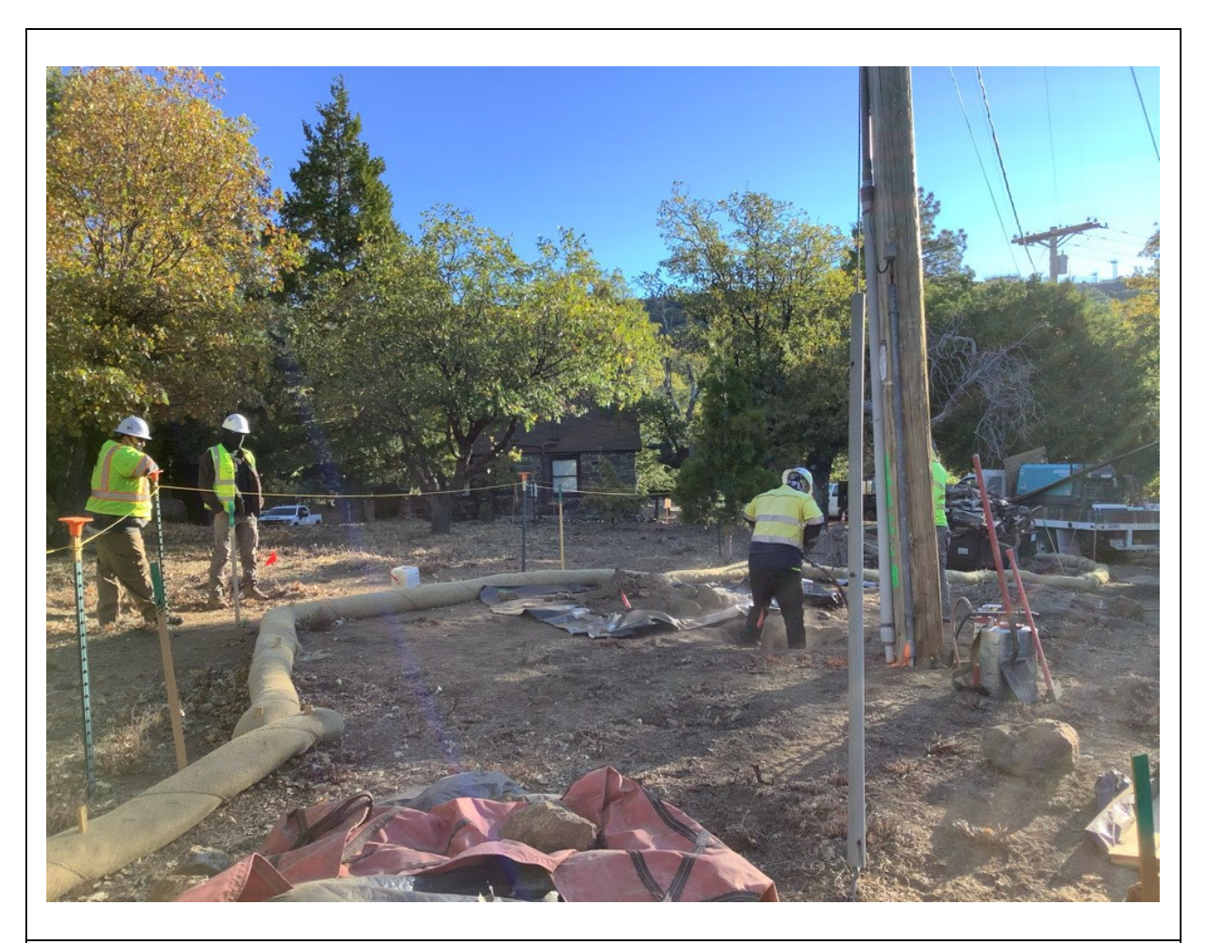
Photo 3: Archaeological and Cultural Monitors were observed monitoring pole hole digging at a site on C 440 in accordance with the HPMP, APM CUL-04, MM CUL-1, and MM CUL-3. In addition, crew members were observed respecting a clearly marked ESA adjacent to the work site in accordance with the HPMP and APM CUL-03.