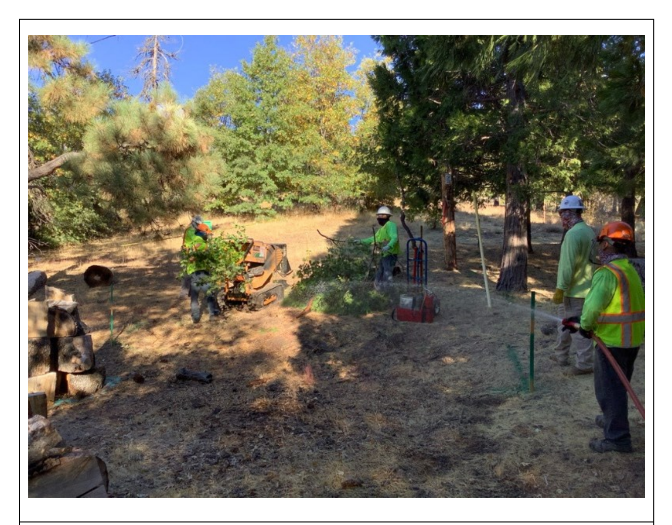
Photo 4: During chipping at Pole P40213 (C 440), a full set of fire tools was observed within 50 feet of the activity, at least 100 gallons of water with pump and hose were observed on site, and the area was wet down to prevent ignitions in accordance with the CFPPP for chipping on NFS land with a PAL D.