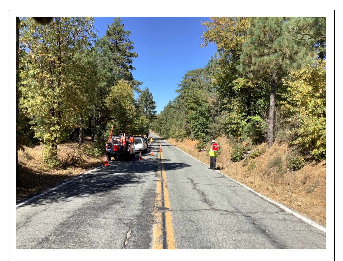
Photo 6: Cones, signage, and flagpersons were used to direct one-way traffic on Sunrise Highway during construction activities at Pole P40476 (C 440) in accordance with APM TRANS-02.