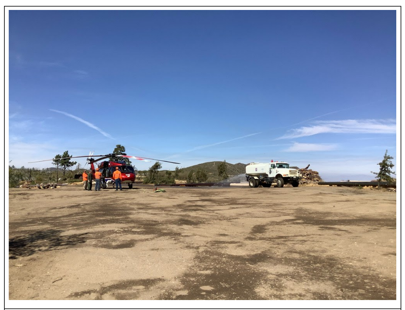
Photo 1: A water tender was observed applying water at Shrine Camp Staging Yard (C 440) prior to helicopter operations to minimize dust emissions from rotor wash in accordance with APM AIR-02 and the Aviation Safety Plan (MM PHS-5).