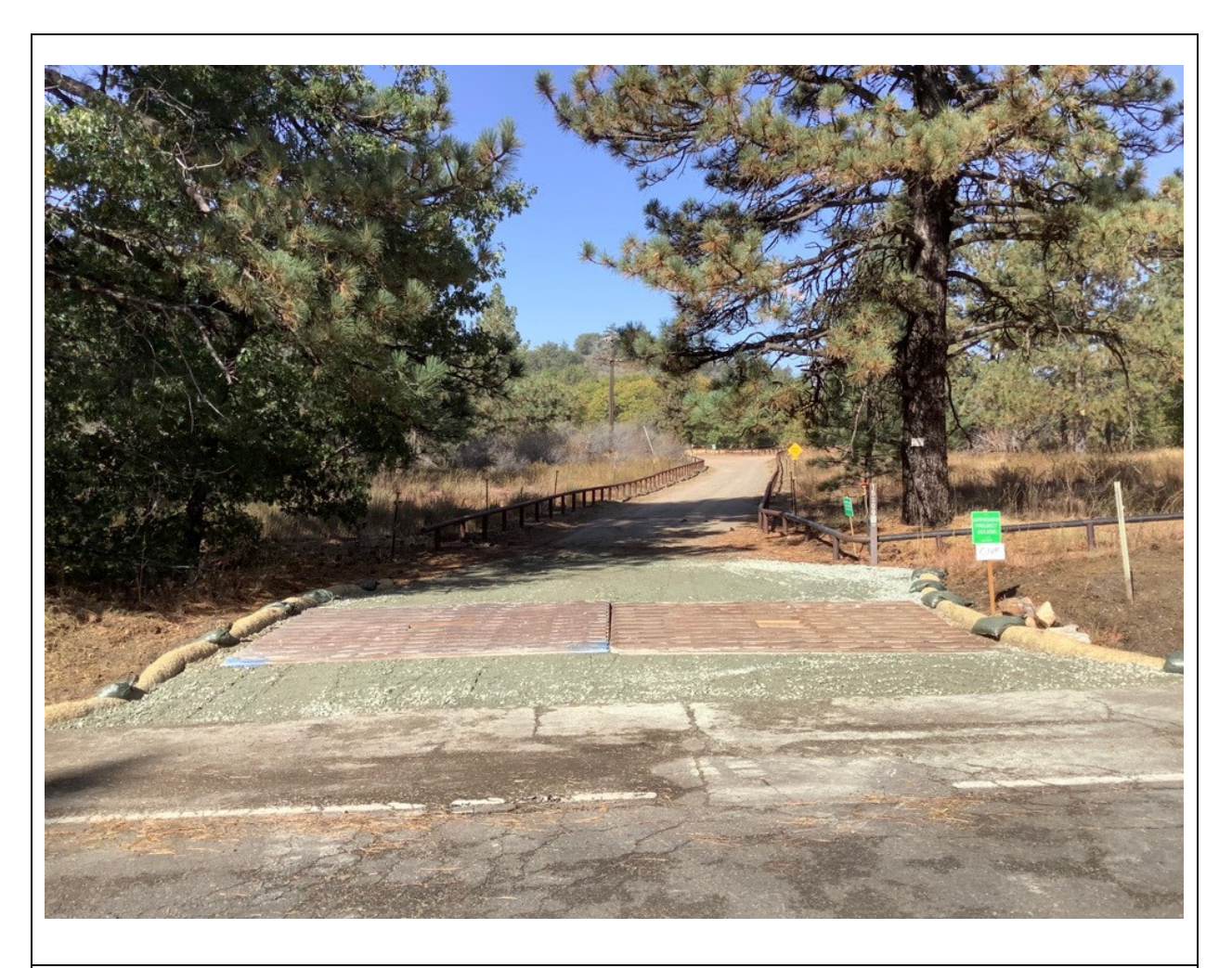
Photo 5: The entrance to Escondido Ravine Road (C 440) was stabilized with gravel and rattle plates to prevent trackout in accordance with the SWPPP.